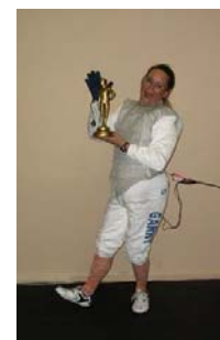
Libby Week 1