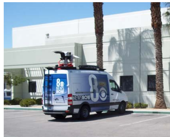
Channel 8 News truck outside Red Rock

I laughed and explained I could probably help him with that. It turned out he needed to do the filming as soon as possible. I got ahold of