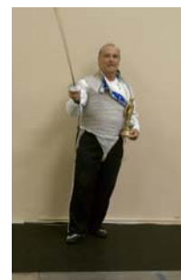
Heik Week 2