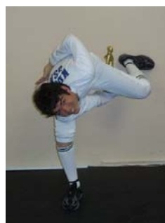
Pierce Week 9